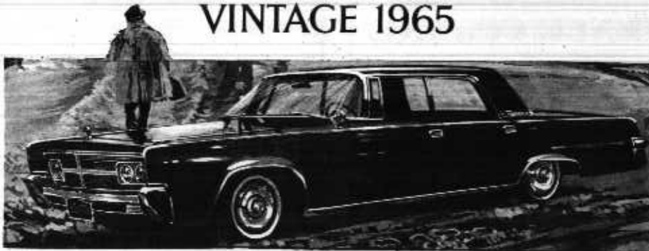
1965 — THE MOST BEAUTIFUL CHRYSLER EVER BUILT