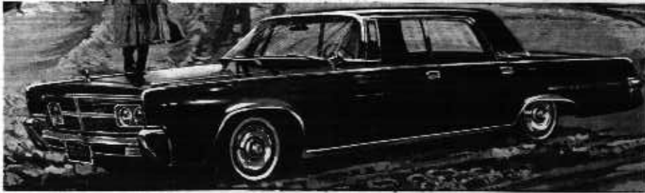
1965 — THE MOST BEAUTIFUL CHRYSLER EVER BUILT