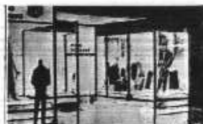
Quality Merchandise Since 1925

Hart Schaffner & Marx Clothing Hickey-Freeman Botany "500" Eagle Stetson Hats — Gant Shirts London Fog — Deansgate MENS FASHIONS ...Visit Our... New University Shop mac kanner 14 East Main Street, Patchogue, N. Y. Natural Shoulder Clothing