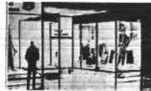
Quality Merchandise Since 1925

ACT I. MUSICAL SYNOPSIS Scene 1: Dogpatch, U. S. A. "It's A Typical Day in Dogpatch, U. S. A." ..... Dogpatchers Scene 2: Yokum Cabin Scene 3: The Fishing Hole "If I Had My Druthers" ..... Li'l Abner and Cronies "If I Had My Druthers" — reprise ..... Daisy Mae Scene 4: Cornpone Square "Jubilation T. Cornpone" ..... Marryin' Sam and Dogpatchers "Rag Offen the Bush" ..... Dogpatchers Scene 5: Dogpatch "Namely You" ..... Daisy Mae & Li'l Abner Scene 6: Cornpone Square "Unnecessary Town" ..... Li'l Abner, Daisy & Dogpatchers Scene 7: A. Government Laboratory B. The President's Office Scene 8: General Bullmoose's Office "What's Good for General Bullmoose" — Bullmoose and Secretaries Scene 9: Dogpatch Scene 10: Dogpatch "There's Room Enough For Us" ..... Dogpatchers "The Country's in the Very Best of Hands" .... Li'l Abner & Pappy Scene 11: Dogpatch Scene 12: Dogpatch "Sadie Hawkins Day Ballet" ..... Dogpatchers — INTERMISSION —