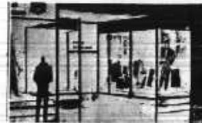
Quality Merchandise Since 1925

Hart Schaffner & Marx Clothing Hickey-Freeman Botany "500" Eagle Stetson Hats — Gant Shirts London Fog — Deansgate MENS FASHIONS ...Visit Our... New University Shop mac Kanner 14 East Main Street, Patchogue, N. Y. Natural Shoulder Clothing