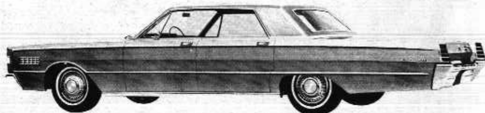
MONTCLAIR MERCURY 1966 In the Lincoln Continental Tradition