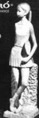
"Lady Tennis Player" 12 1/2" tall glaze or matte finish.

Superbly executed by world famous Porcelanosa Lladro of Spain.