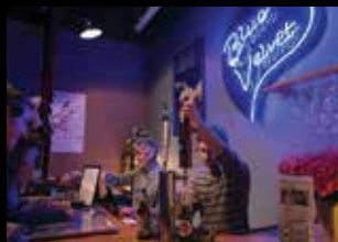
Blue Velvet Lounge Wine Bar