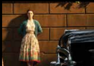
Critically Acclaimed Films

20 Terry Street, Suite 121 Patchogue, NY 11772 (631) 438-0083 www.plazamac.org