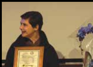
Guest Speakers & Seminars