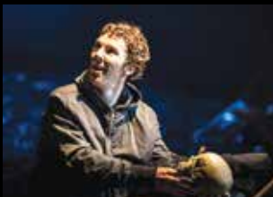
Filmed Plays & Operas