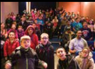
Media Literacy & Field Trips