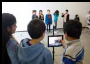
Animation & Filmmaking Classes