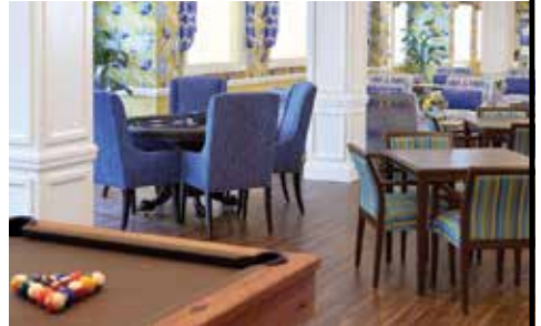
Photos: Bistro, The Bristal at Holtsville; Dining Room & Game Room, The Bristal at Sayville