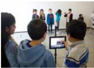
Animation & Filmmaking Classes