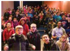
Media Literacy & Field Trips