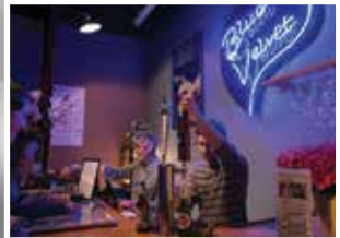
Blue Velvet Lounge Wine Bar