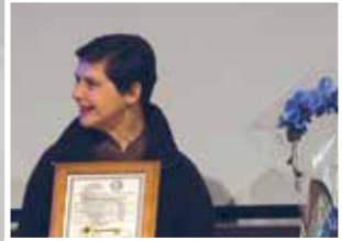
Guest Speakers & Seminars