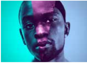
Critically Acclaimed Films