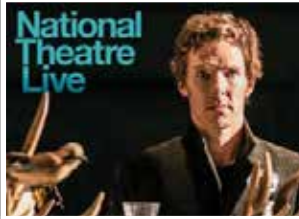
Filmed Plays & Operas