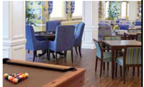
Photos: Bistro, The Bristal at Holtsville; Dining Room & Game Room, The Bristal at Sayville