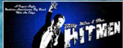
FEBRUARY 8 A Vegas - Style, Modern Americana Big Band With An Edge