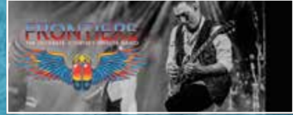
FEBRUARY 15 A Journey Tribute Celebration