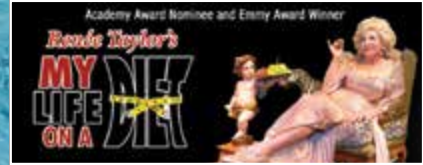
FEBRUARY 28, 29 From TV's The Nanny ! Renee Taylor's - My Life on a Diet