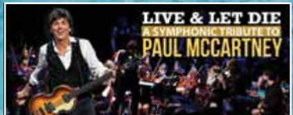
APRIL 4, 5 Live and Let Die - Symphonic Tribute to Paul McCartney with Full Orchestra