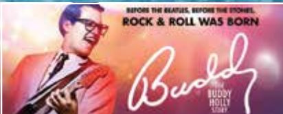
FEBRUARY 13, 14 The Buddy Holly Story