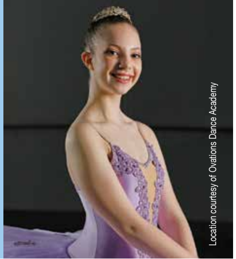
Location courtesy of Ovations Dance Academy

We've served this richly diverse region as a community hospital for more than 60 years. And as the area has grown, so have we. But as Long Island doctors, nurses, and healthcare professionals, we've never outgrown our devotion to the health of the community we all call home.