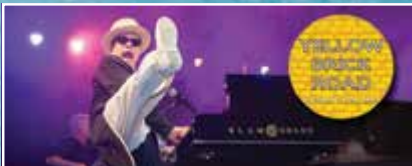
MARCH 28 Yellow Brick Road - An Elton John Tribute