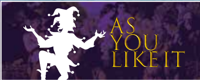
FEBRUARY 21-23 Shakespeare's Comedy - As You Like It