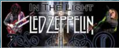
FEBRUARY 7 A Led Zeppelin Tribute