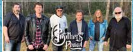
MARCH 27 An Allman Brothers Tribute