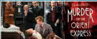
MARCH 6-15 Agatha Christie's Murder on the Orient Express adapted by Ken Ludwig