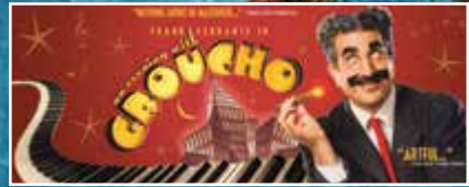
FEBRUARY 1, 2 An Evening with Groucho Marx