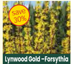
Lynwood Gold - Forsythia

15 Gallon: $74. 99 (Reg. $114.99) 30 Gallon: $184. 99 (Reg. $249.99)