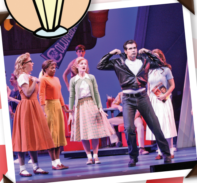
National Touring Production