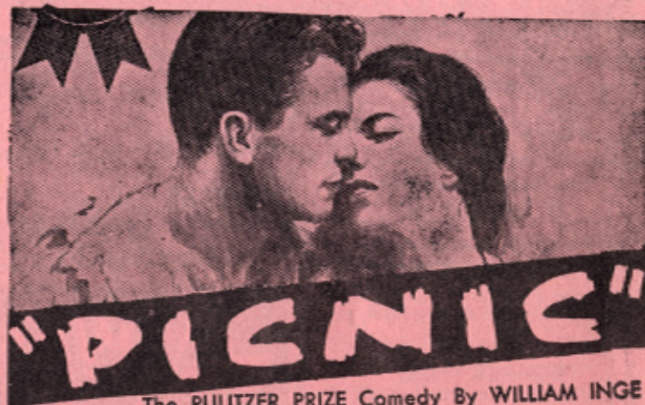
The PULITZER PRIZE Comedy By WILLIAM INGE